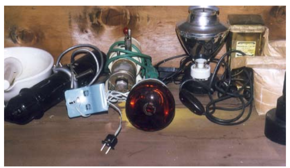
Instruments used to make heroin from opium in Afghanistan (United Nations Office on Drugs and Crime).

▼ n June, the Security Council called upon all Member States to improve monitoring of the international trade in chemical precursors used to make heroin in order to better combat drug trafficking in Afghanistan.