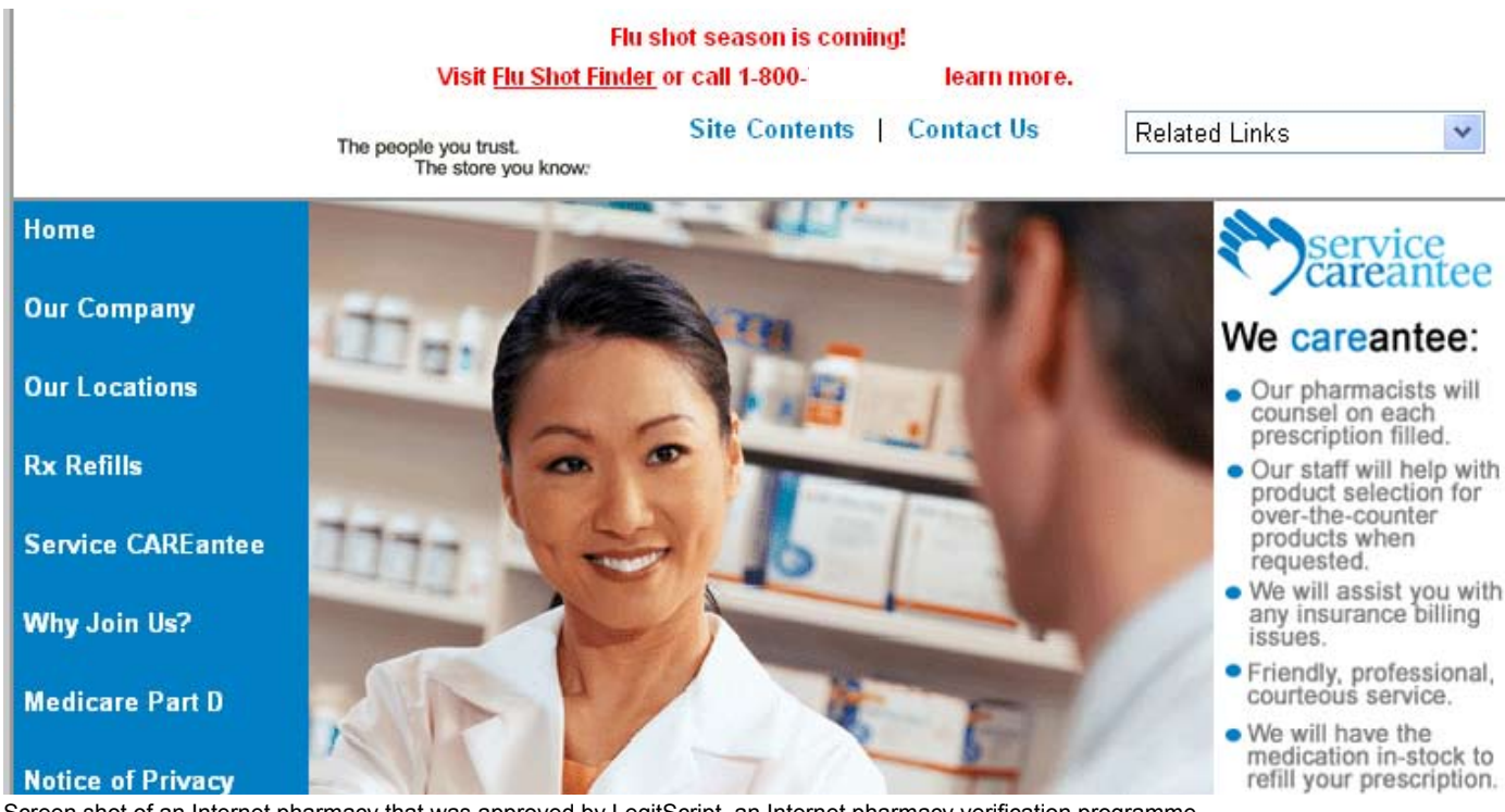
Screen shot of an Internet pharmacy that was approved by LegitScript, an Internet pharmacy verification programme.