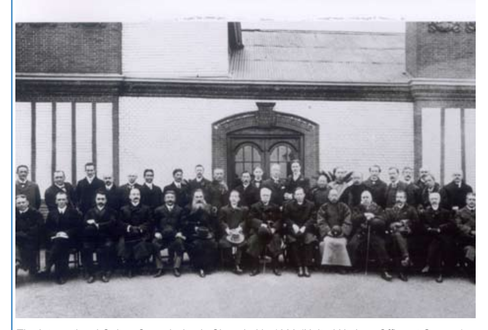
The International Opium Commission in Shanghai in 1909.

Next year, the current international drug control framework will celebrate its one hundredth anniversary. On 26 February 2009, the Government of China will host an event to commemorate the meeting of the first International Opium Commission, which took place in Shanghai in 1909.