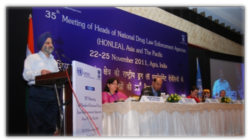
35 th\ \textit{Meeting of Heads of National Drug\ Law\ Enforcement\ Agencies, held\ in\ Agra, India, in\ November\ 2011