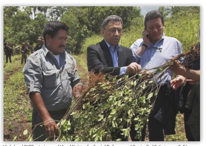
High-level INCB mission and Vice-Minister for Social Defense and Controlled Substances (left)

Discussions concentrated on denunciation by the Plurinational State of Bolivia of the 1961 Convention in June 2011 and its serious implications for international drug control. The findings of the mission will be reviewed by the Board at its next session in February 2012.