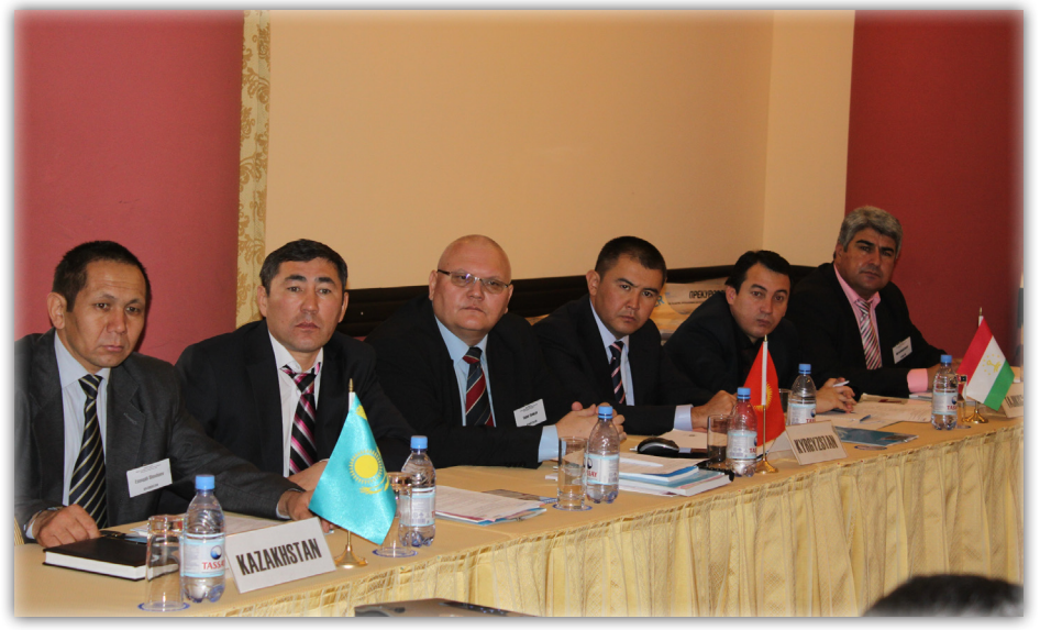
Regional workshop on regulatory mechanisms for precursor control, held in Almaty, Kazakhstan, in October 2011

The representatives of the Central Asian countries and CARICC provided an overview of the current drug and precursor-related situation in Central Asia. The representative of CEFIC shared experiences and practical implications for the chemical industry with regard to precursor control in the European Union, based on legal obligations and voluntary cooperation with competent national authorities.