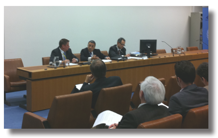
President of INCB participates in an informal dialogue with NGOs during the recent CND session in Vienna