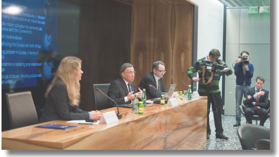
Launch of INCB Annual Report in Vienna on 28 February 2012

The reports are available on the Board's website (www.incb.org).