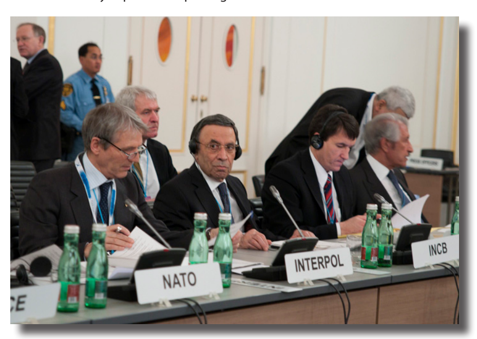
President of INCB (centre) participates in Paris Pact Ministerial Conference

The outcome of the Conference was the Vienna Declaration, adopted by the 55 Paris Pact partners. It is a statement of international commitment to act in a "balanced and comprehensive manner" against the menace of illicit Afghan opiates. In the Declaration, the Paris Pact partners recognized that "the narcotics problem is a global challenge which also requires a global response, including addressing the demand and supply sides".