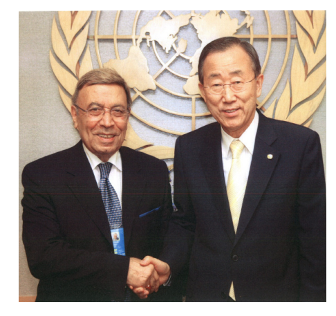
UN Secretary-General Ban Ki-Moon meets President of INCB Hamid Ghodse

The President briefed the Council on a number of issues, including the need for consistent application of treaty obligations at the national level; the availability of opioid-based medicines; the abuse of prescription drugs; the control of precursor chemicals; and illegal Internet pharmacies. The President identified four significant challenges: the growing number of countries where amphetamine-type stimulants are being illicitly manufactured; the increasing trafficking in and abuse of substances that are not under international control; the diversion of psychotropic