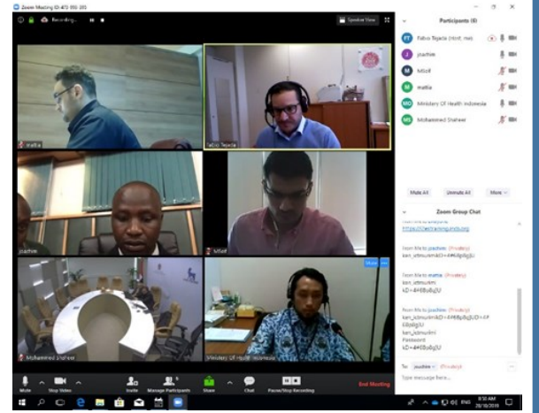
held on 28 October 2019

More details of the I2ES training activities are shown in the interactive Webinar with CNAs of Indonesia, Kenya, Qatar and U.A.E. map of the Training section of the I2ES webpage. Feel free to contact