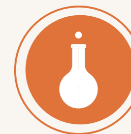
Laboratory chemicals suppliers