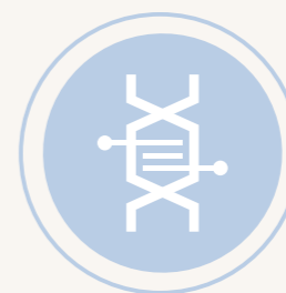
Toll manufacturers and contract manufacturers