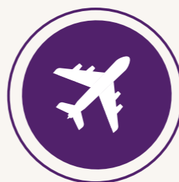
Exporters and importers