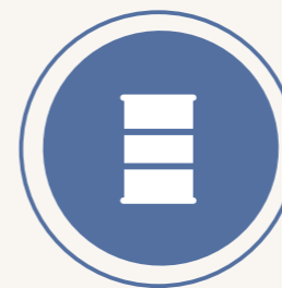
Large-scale producers of commodity chemicals