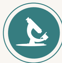
Research and development service providers