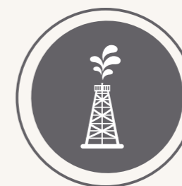
Industrial parks and industrial estates