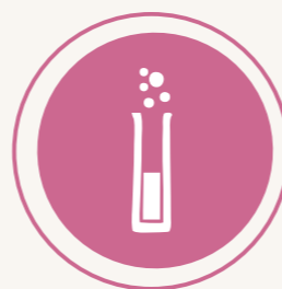
Producers of fine and specialty chemicals*